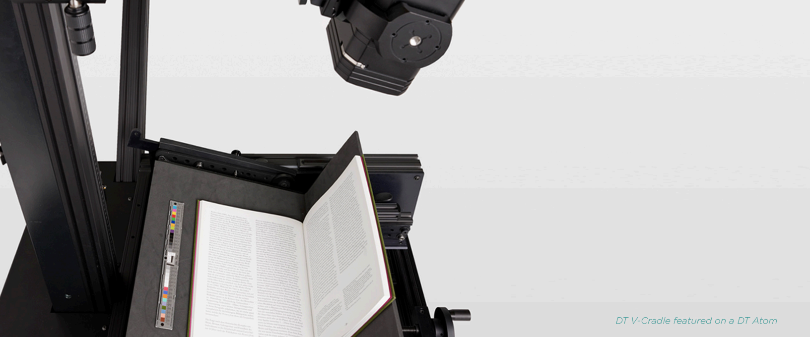
DT V-Cradle featured on a DT Atom